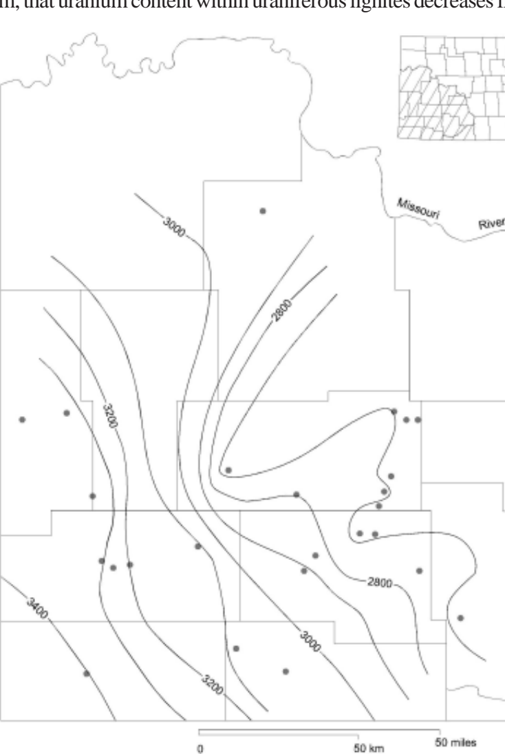
Figure 3. Contour map of the White River unconformity in w Dakota. Modified from Murphy et al., 1993.